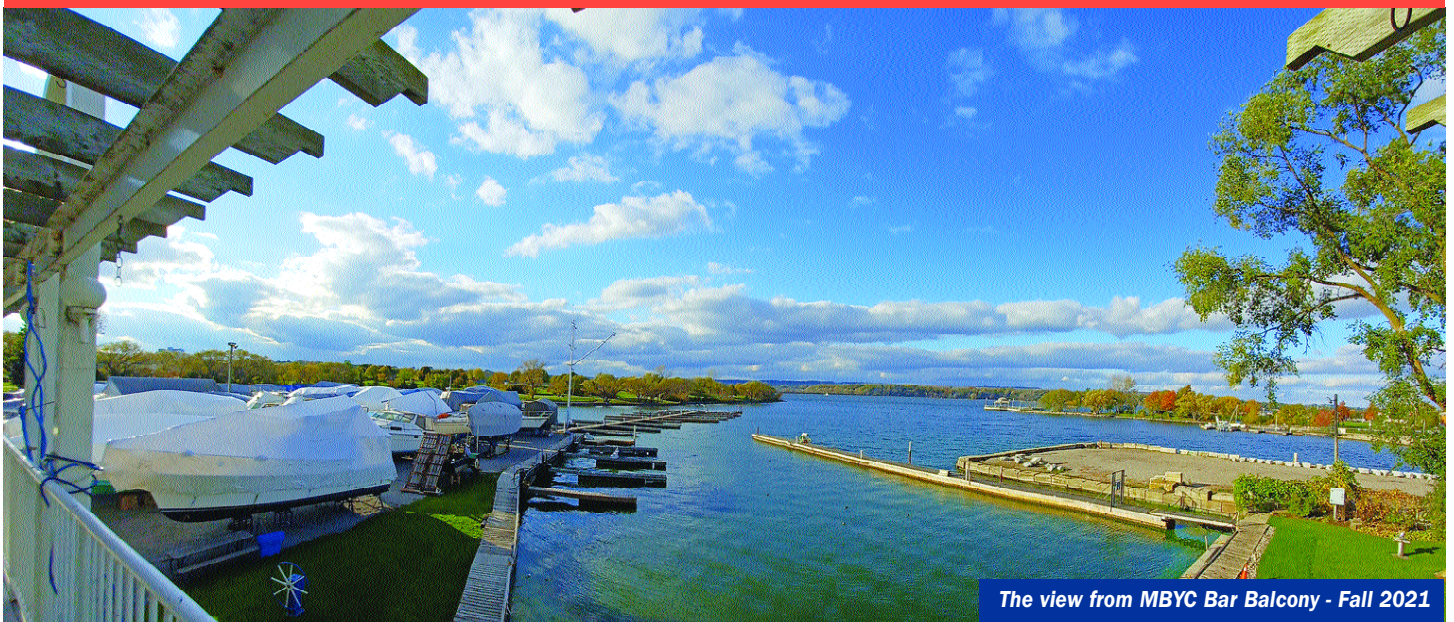
The view from MBYC Bar Balcony - Fall 2021