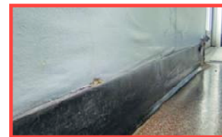
Exterior Wall 2

Then in the spring, we will start some refurbishment of the old Clubhouse. It's in need of some serious repairs. More on this in our next Mariner issue.