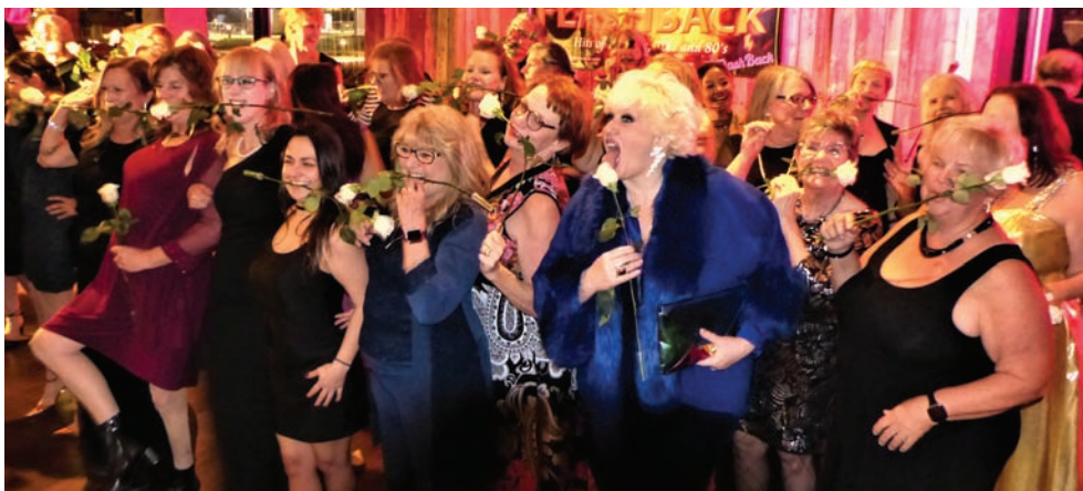
Commodore's Ball 2022 at the Waterfront Centre was a big success!